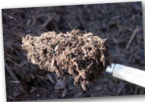
Linda Cobb, Certified Master Gardener

Double Ground Hardwood Bark Mulch is appropriate for just about any landscape situation, flat or sloped. It is a finely ground product and suitable for evergreens and deciduous plants, shrubs and trees. It lasts about 12-18 months.